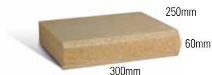
Universal Capping Unit