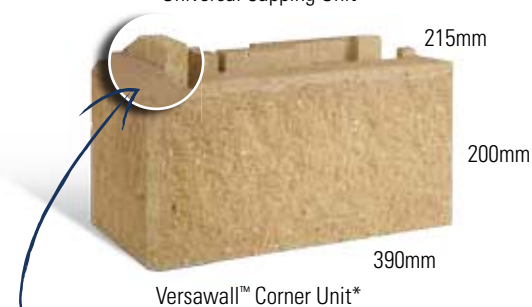
Versawall™ Corner Unit*